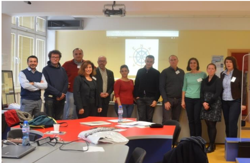
Kick-off meeting in Sofia, October 2017

the interface of the platform will be translated in the languages of the project partners and in English in order to ensure sustainability of the project's results and to allow the common game-based strategy for IL training at Bachelor's level in Europe through the blended learning method to reach a wider target group – Humanities students outside the participating universities and in other European countries. After the pilot testing of the games and the platform a Handbook summarizing the project's results together with success stories from the testing phases will be elaborated to support future users (students and tutors) of the developed methodology for game-based learning approach to IL. Detailed guidance on how to replicate the model of NAVIGATE and its results will be also provided.